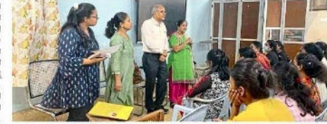
मुंबई : नर्सिंगचे शिक्षण देणाऱ्या एसएनडीटीमधील १०० हून अधिक विद्यार्थिनींनी जर्मनीत नर्सिंग क्षेत्रात कामे करायची संधी उपलब्ध करून देण्यासाठी एसएनडीटी विद्यापीठाच्या वतीने एक अभ्यासक्रम सुरू करण्यात आला आहे.

मुंबई, ता. ३ : देशातील शिक्षणाच्या प्रचंड योटा वरचा बाबतच्या मुलींना यावेळी उपभोगीत नर्सिंग विद्यापीठात (एसएनडीटी) येथील नर्सिंग विभाग येथल्या एकूण १०० हून अधिक विद्यार्थिनींना जर्मनीत नर्सिंग क्षेत्रात कामे करायची संधी उपलब्ध करून देण्यासाठी एसएनडीटी विद्यापीठाच्या वतीने एक अभ्यासक्रम सुरू करण्यात आला आहे. या अभ्यासक्रमातून जर्मनीत नर्सिंग क्षेत्रात काम करायची संधी उपलब्ध करून देण्यासाठी एसएनडीटी विद्यापीठाच्या वतीने एक अभ्यासक्रम सुरू करण्यात आला आहे.